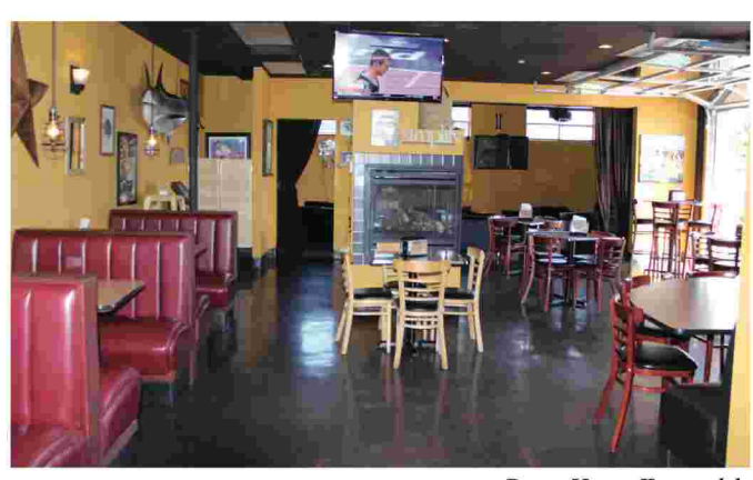
Dawg House II remodel

In remodeling, building and setting up the new restaurant,