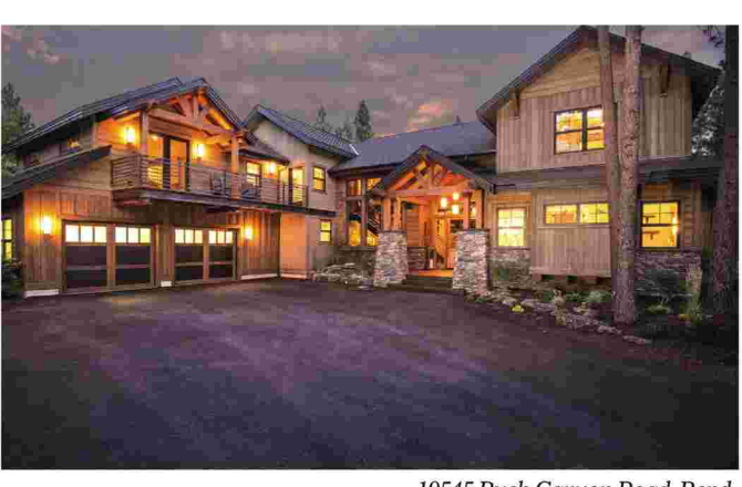
19545 Buck Canyon Road, Bend

At this house in Bend, all lumber that was not rotten or too small to use was cleaned and saved. Most of the materials went to creating or restoring other period structures.